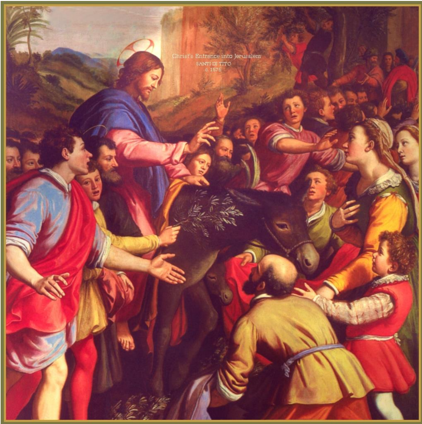
Christ's Entrance into Jerusalem SANTI DI TITO c. 1575