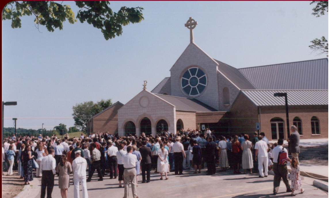
CTK parishioners wait to enter the church for the first time on Sunday, June 24, 2001. This June marks the 20th anniversary of the dedication of our church.