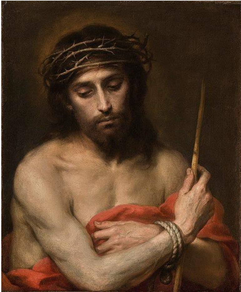
Ecce Homo (Behold the Man) , by Murillo (1617-1682)