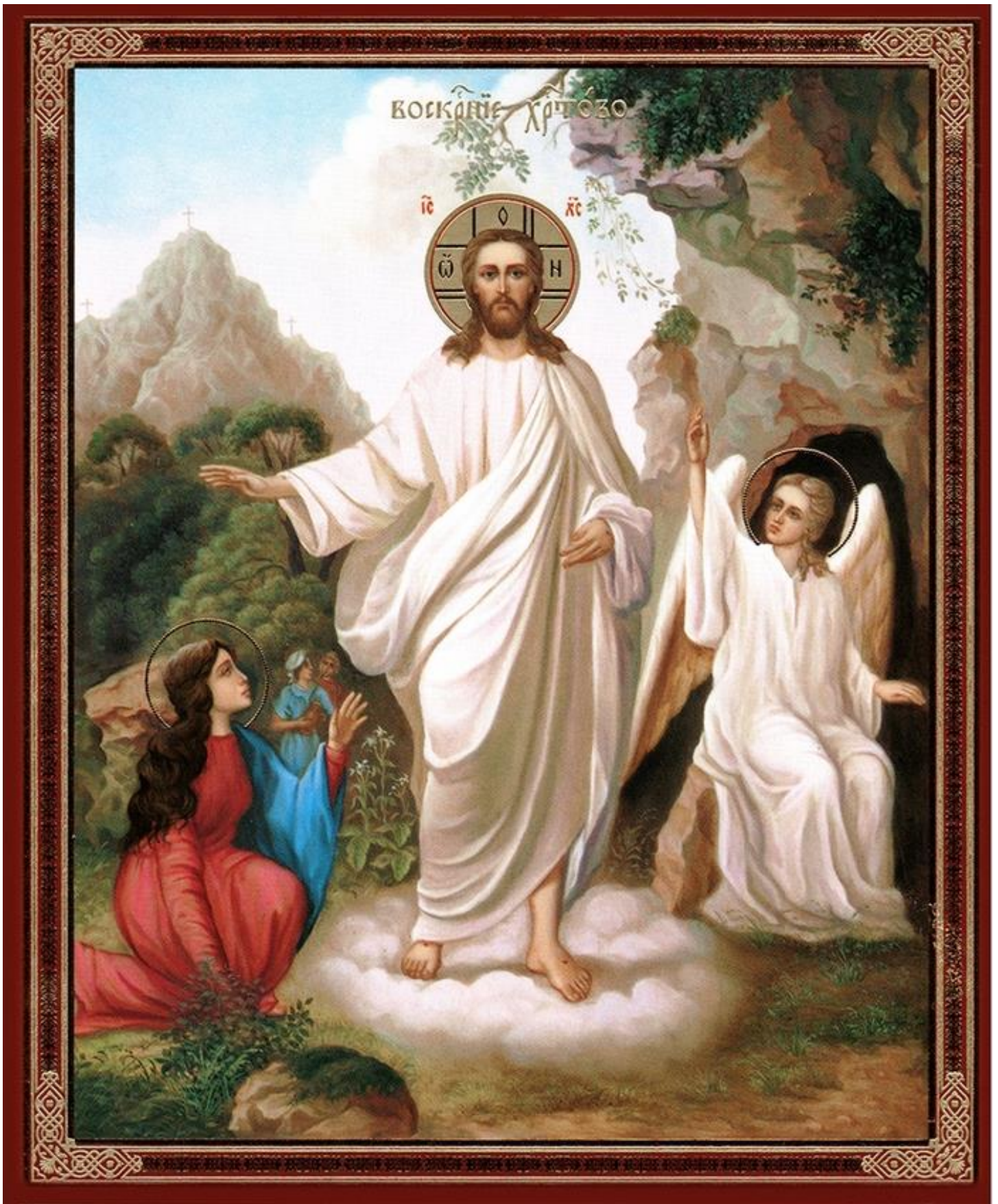
Christ at the Tomb, Orthodox Icon