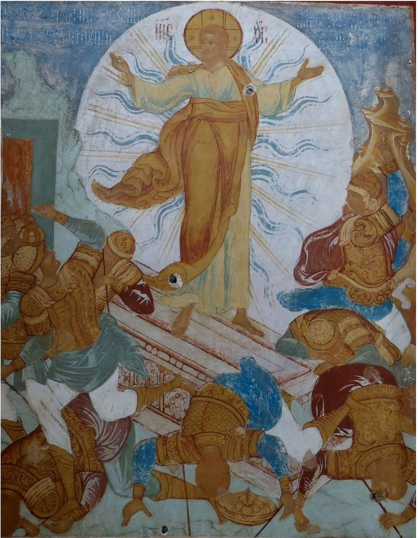
Russian Icon, Unknown Title