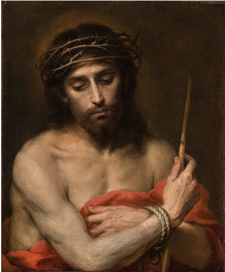
Ecce Homo (Behold the Man) , by Murillo (1617-1682)

Dear Jesus, thank you for all you suffered on the way to the cross. I know you did it for love of me. Help me to think of you often and remember to love others. Amen.