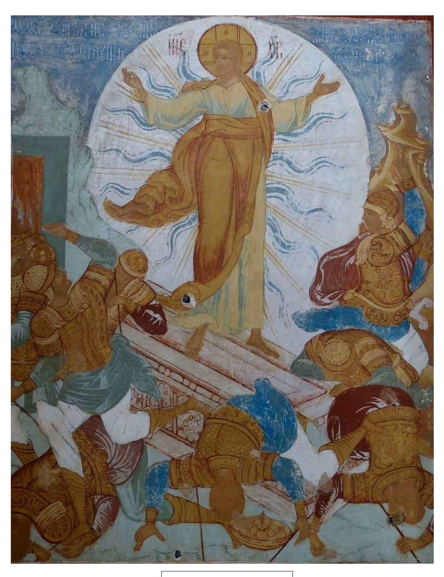
Russian Icon, Unknown Title